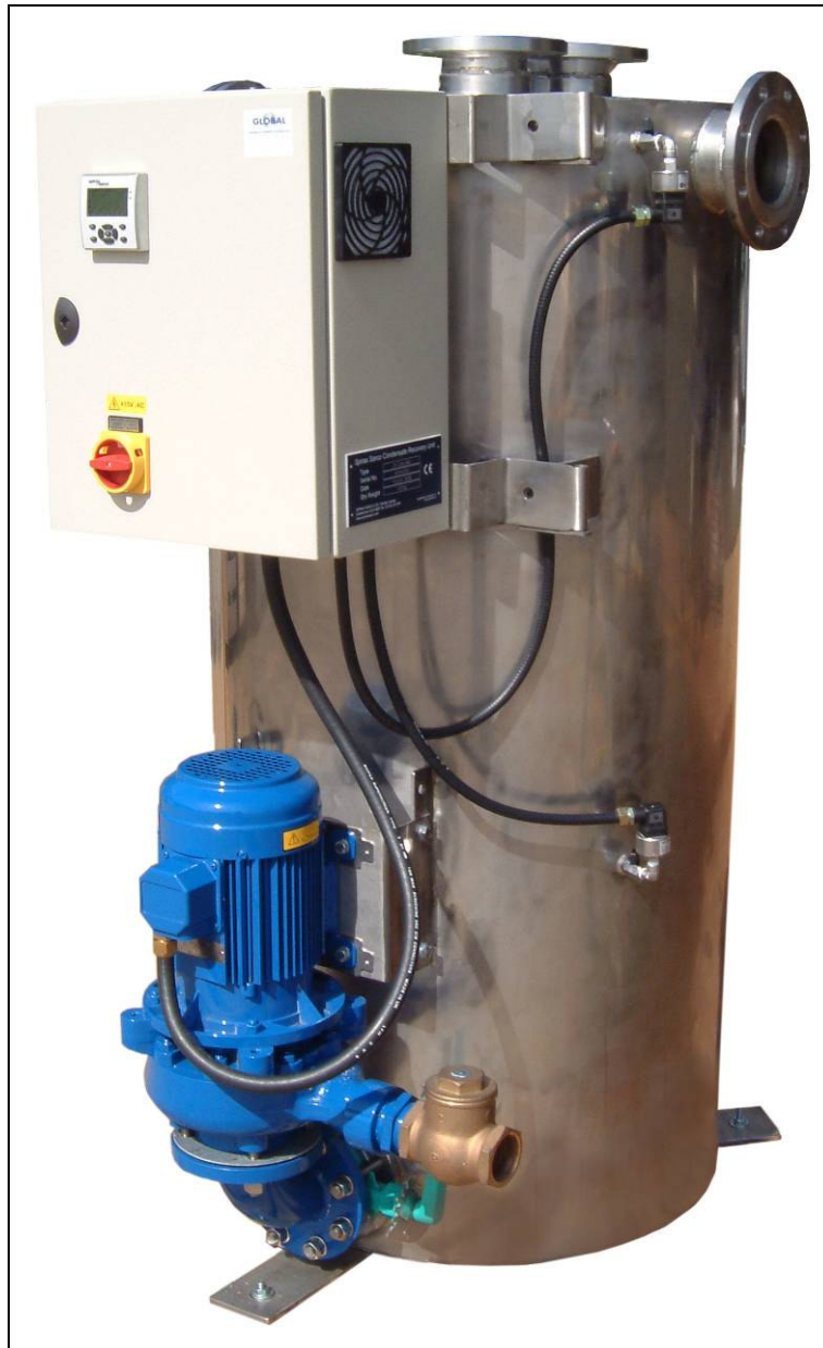
The new Ci-Nergy variable speed technology Condensate Recovery Unit