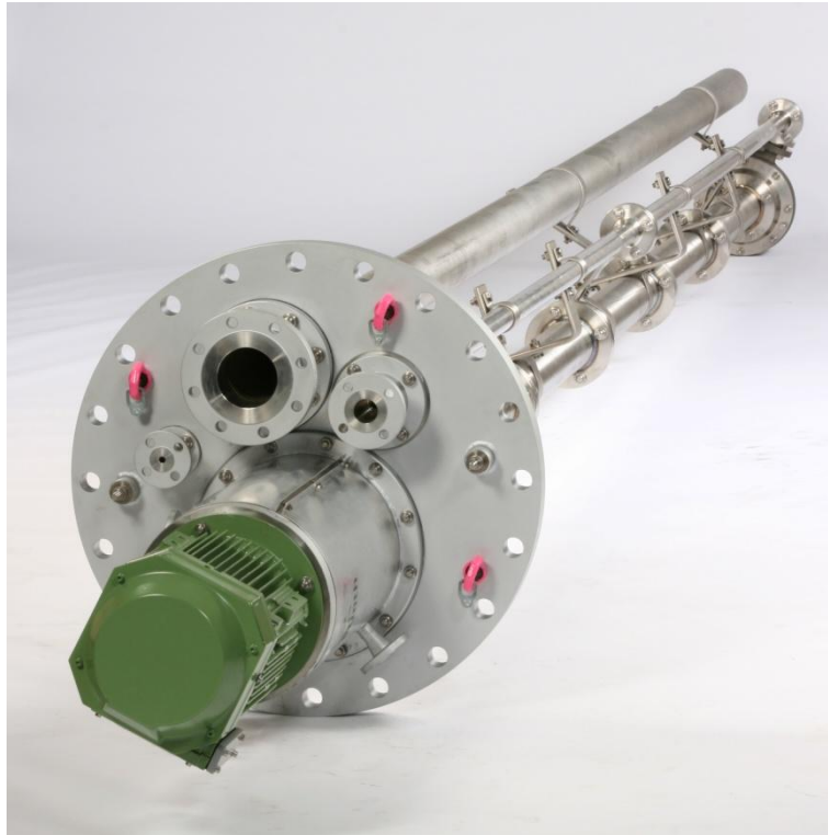
Bespoke design API 610 Vertical Sump Pump