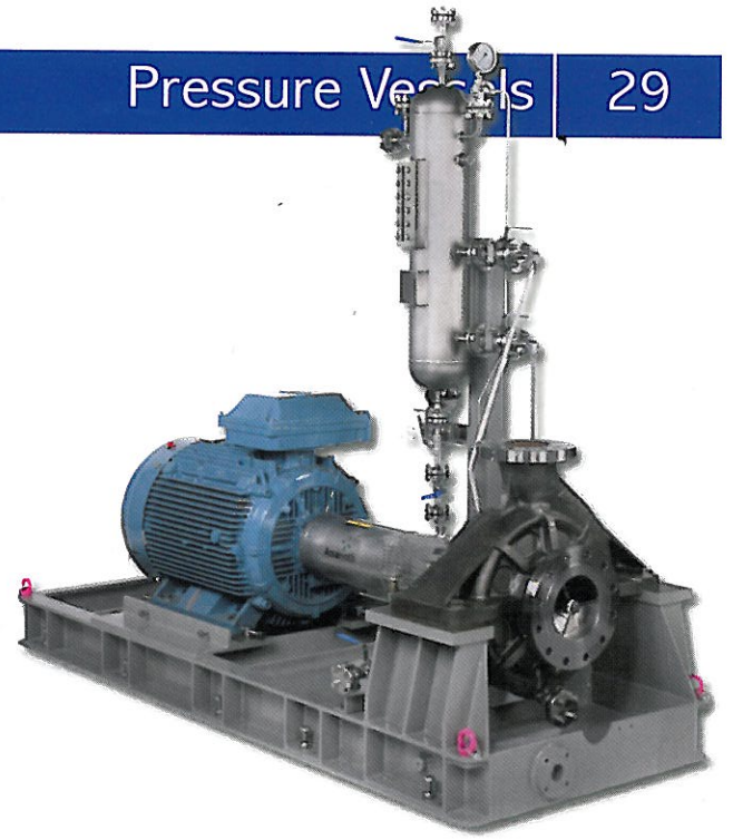
Amarinth API 610 10th edition pump

AMARINTH, a leading company specialising in the design, application and manufacture of centrifugal pumps and associated equipment to the chemical and petrochemical industries has recently completed its first order for Global Process Systems.