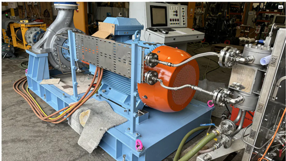
API 610 OH2 pump for FPSO Atlanta undergoing final testing at Amarith's facilities