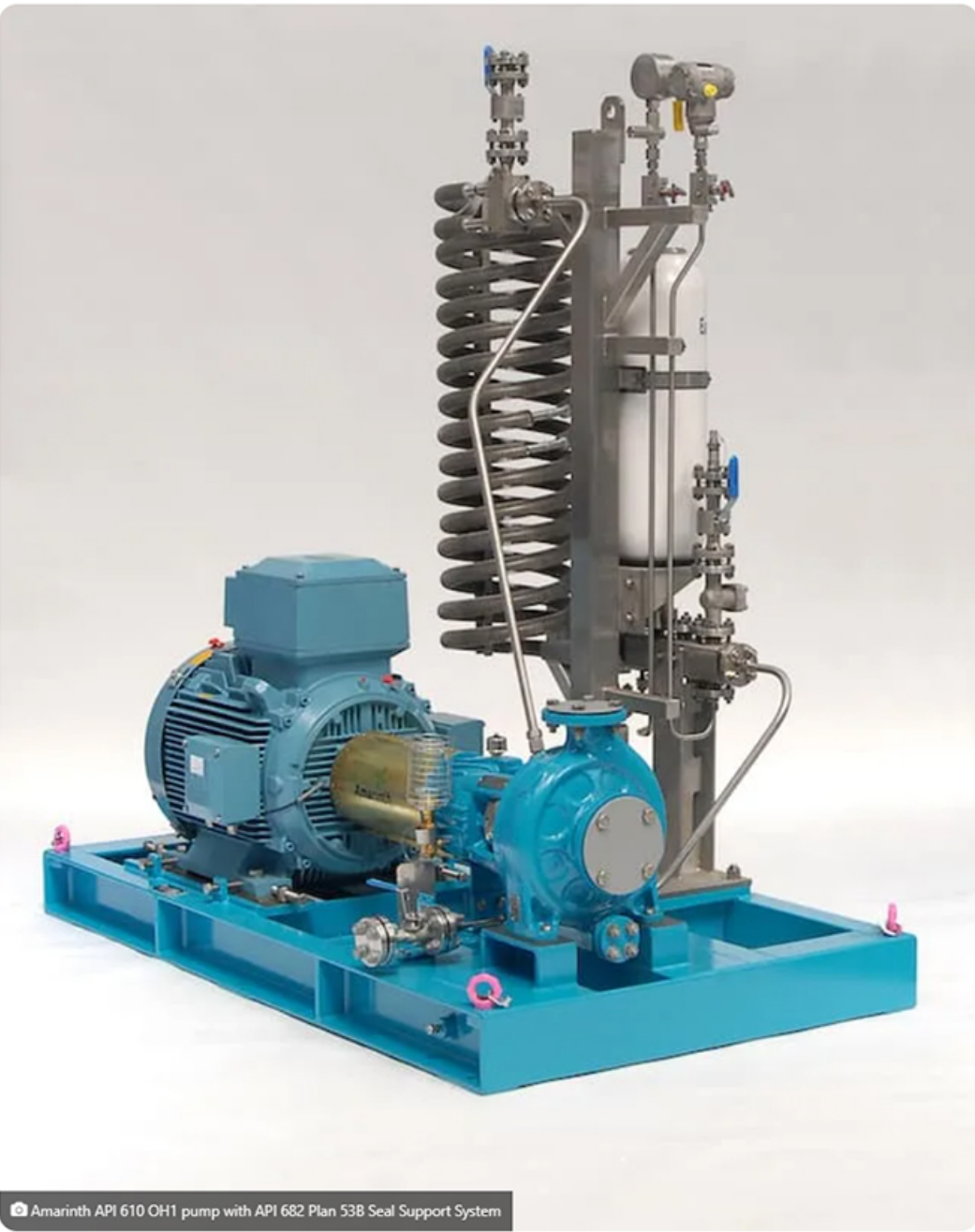
Amarinth API 610 OH1 pump with API 682 Plan 53B Seal Support System

Home / Fluids Handling / Amarithh secures order from Azku Global Services for $200K of API 610 OH1 pumps for Majnoon Oil Field, Iraq