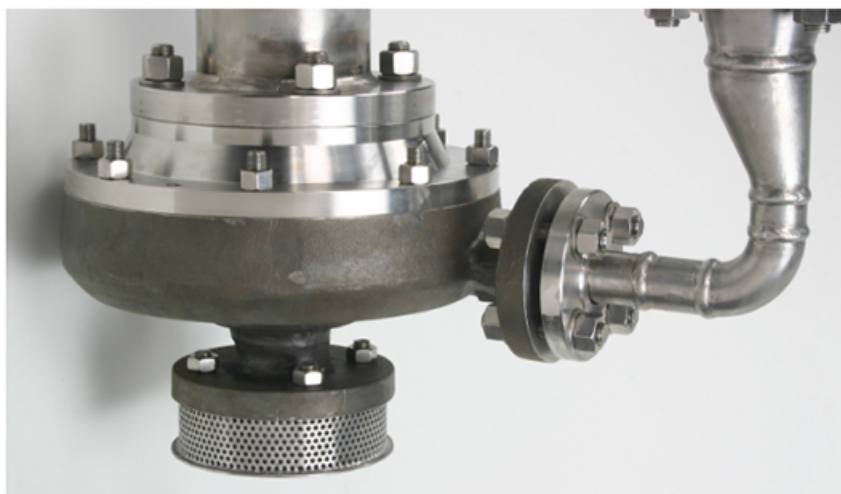
Impeller wetted-end of Amarith API 610 VS4 pump. -