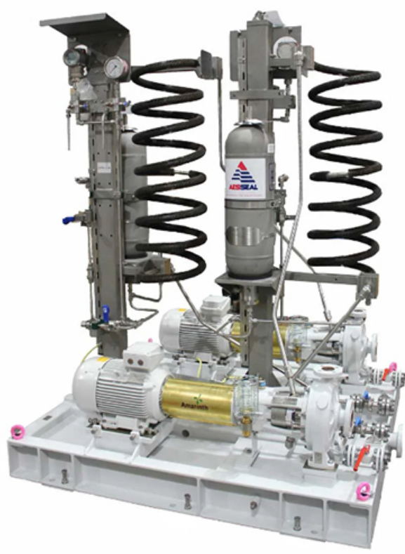
Amarinth API 610 OH1 pumps on bespoke skid ready for shipment to Kanfa

Home / Fluids Handling / Amarith delivers API 610 OH1 pumps to Kanfa for the second Karish FPSO oil train