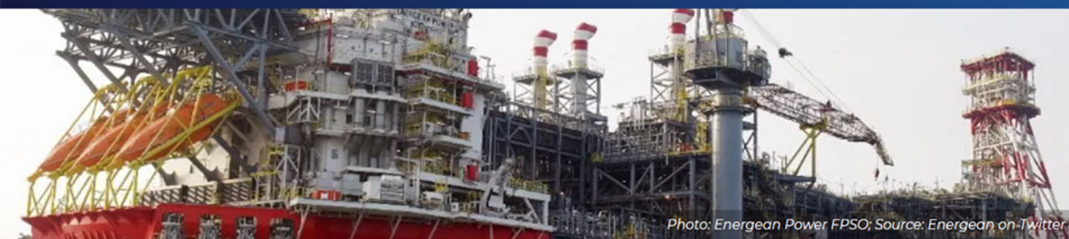
Photo: Energean Power FPSO