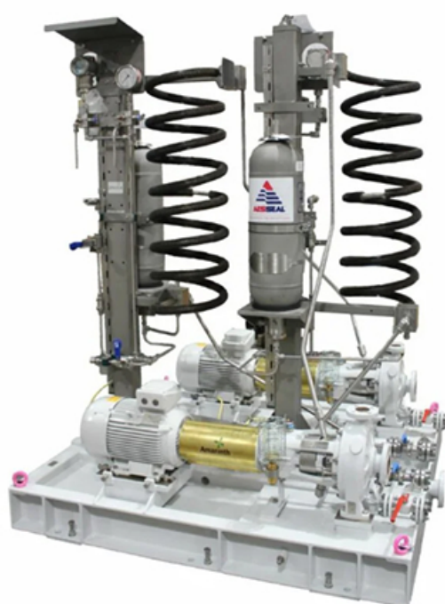
Amarinth API 610 OH1 pumps on bespoke skid ready for shipment to Kanfa

Furthermore, a bespoke single footprint skid design was required due to space restrictions aboard the FPSO, thus, both pumps and the two Plan 53B Seal Support systems are all mounted together. The company highlighted that the pumps were delivered on “a very aggressive 30-week lead time” to fit with the build schedule of the new M10 topside module.