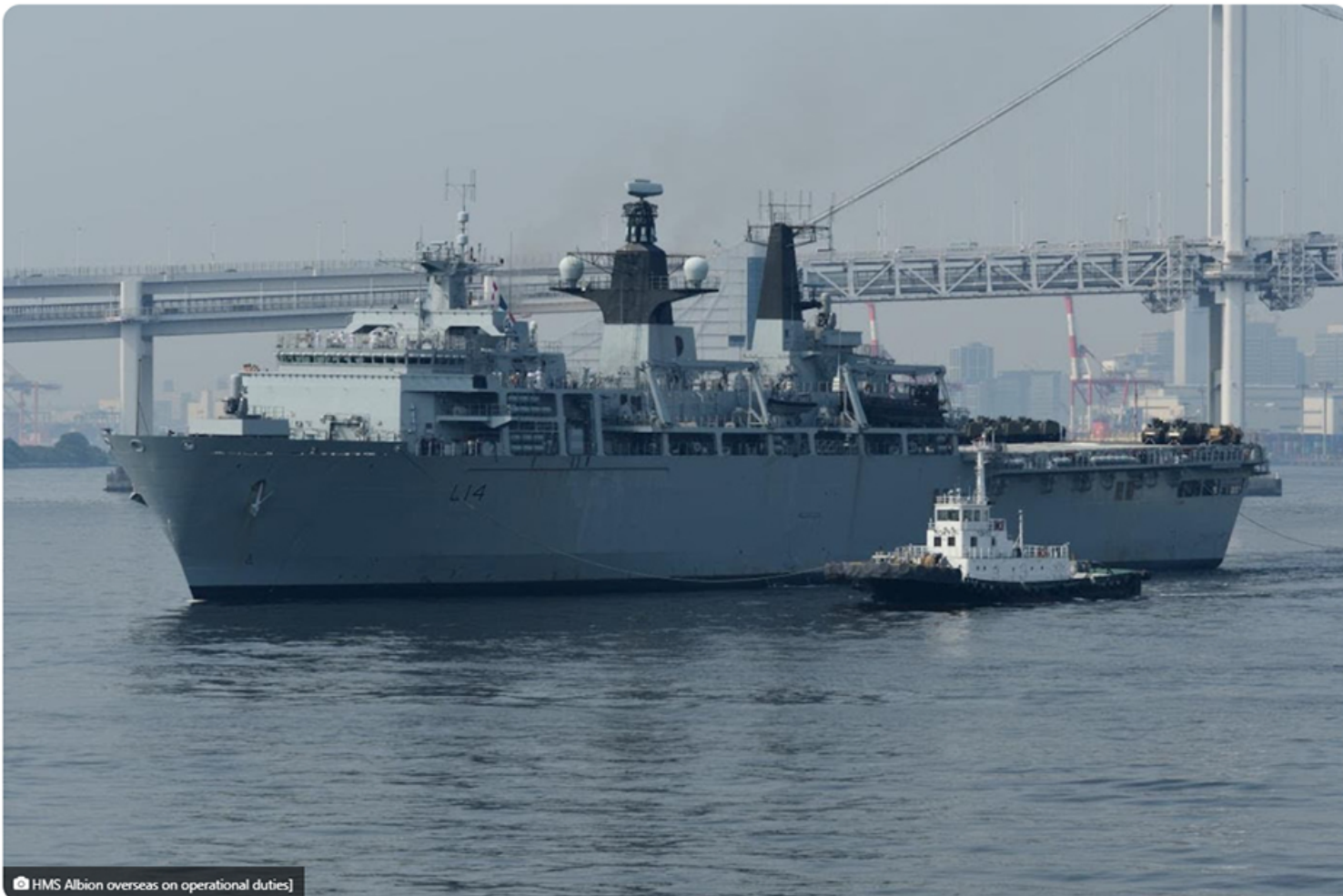
HMS Albion overseas on operational duties

Home / Fluids Handling / Amarith supplies directly interchangeable pumps to Babcock for refit of HMS Albion