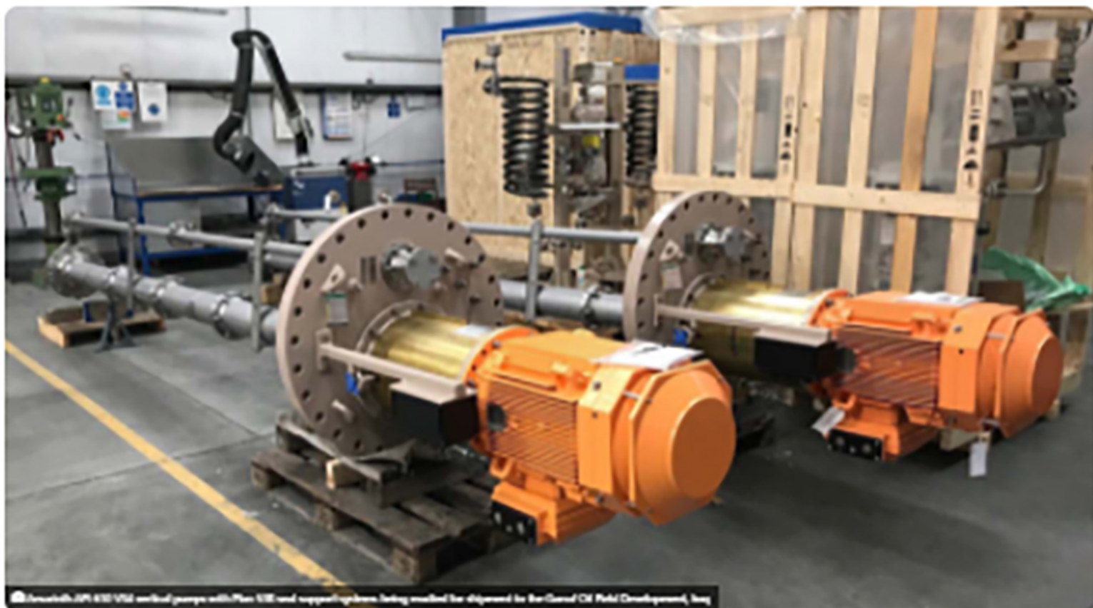
Amarinth API 610 VS4 vertical pumps with Plan 53B seal support systems being loaded for shipment to Garraf Oil Field Development, Iraq

Home / Pumps Handling / Amarith delivers $650,000 of API 610 VS4 pumps to Garraf Oil Field Development, Iraq