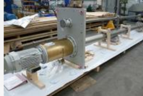
Amarinth builds ever closer relationships with European EPCs with an order for API 610 VS4 vertical pumps from Cannon BONO Artes

Amarinth, specialising in the design, application and manufacture of centrifugal pumps and associated equipment to the oil and gas, petrochemical, chemical, industrial and power markets, is developing ever closer relationships with European EPCs with an order to supply high-quality, bespoke API 610 VS4 vertical pumps to Cannon BONO Artes for use by ADCO in the Middle East.